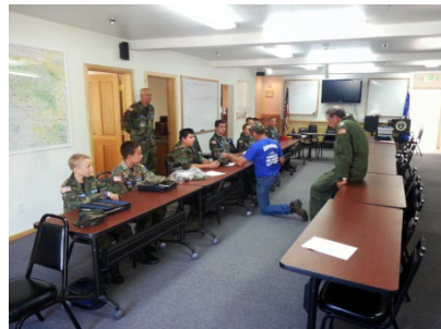
"Don't puke in my airplane!" And nobody did!