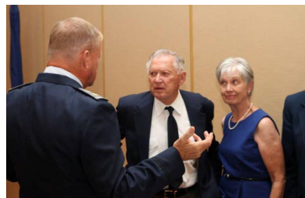
What? They made you Group Commander? I don't believe it!