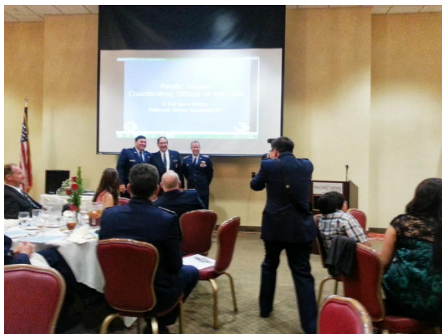
Talk to the camera, baby!