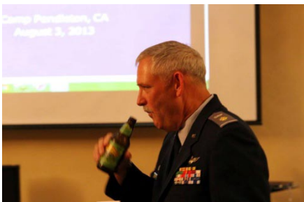
I can get through this!