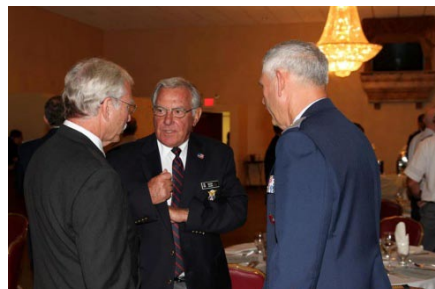
Umm... Will you take a check?