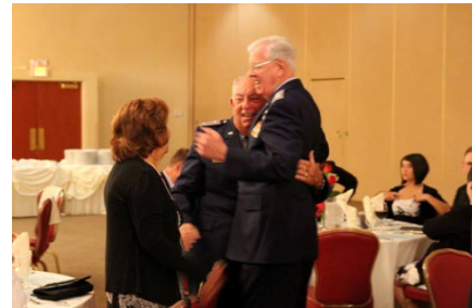
Does this make you a little uncomfortable, as well?