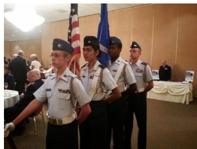
The Outstanding SQ 47 Skyhawk Color Guard!