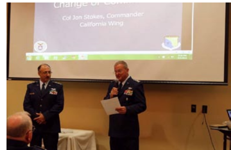
And after I was born in the log cabin...