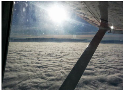
On top headed to L35

Squadron 87 had two days of flying cadets out of Big Bear City Airport (L35). On Wed 31 July, Jerry Rohles and Roy Knight flew a total of eight cadets out of the beautiful mountain airport. On Friday 2 August, Jerry returned with Stu Oster this time and flew 7 cadets. The Big Bear Squadron 6750 has been looking for qualified pilots to fly their orientation flights and mentioned this to Stu at the Wing Encampment. That is all it took! We look forward to supporting them in the future.