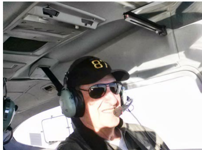
I don't think he is enjoying himself.